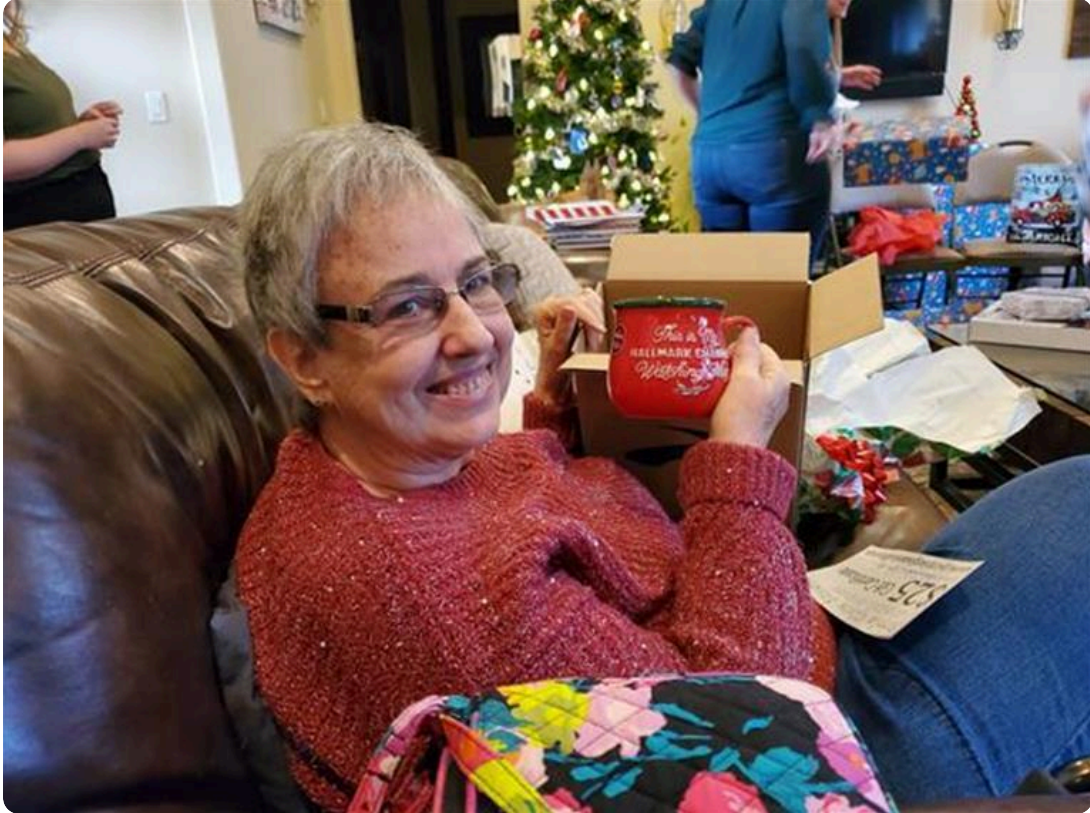
Mom Loved her Hallmark